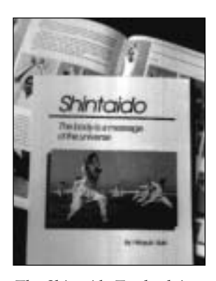
The Shintaido Textbook is a must-have for all serious Shintaido practitioners.

by Faith Ingulsrud ($3) Written by an American Shintaidoist who grew up in Japan, this handbook helps ease the culture shock sometimes experienced by Americans encountering Japanese customs and terminology in Shintaido. Includes a glossary and description of the basic structure of a Shintaido practice.